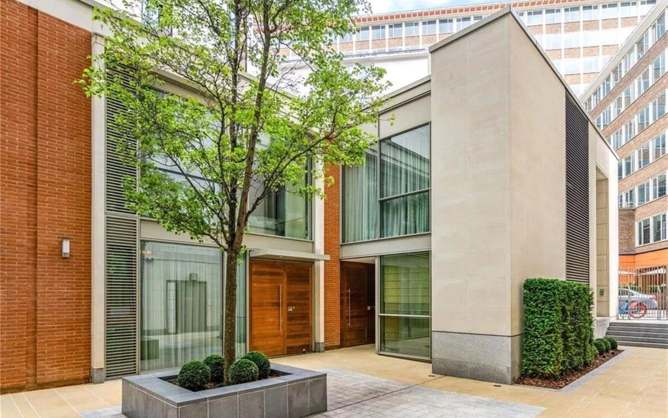
The Knightsbridge Apartments, SW7