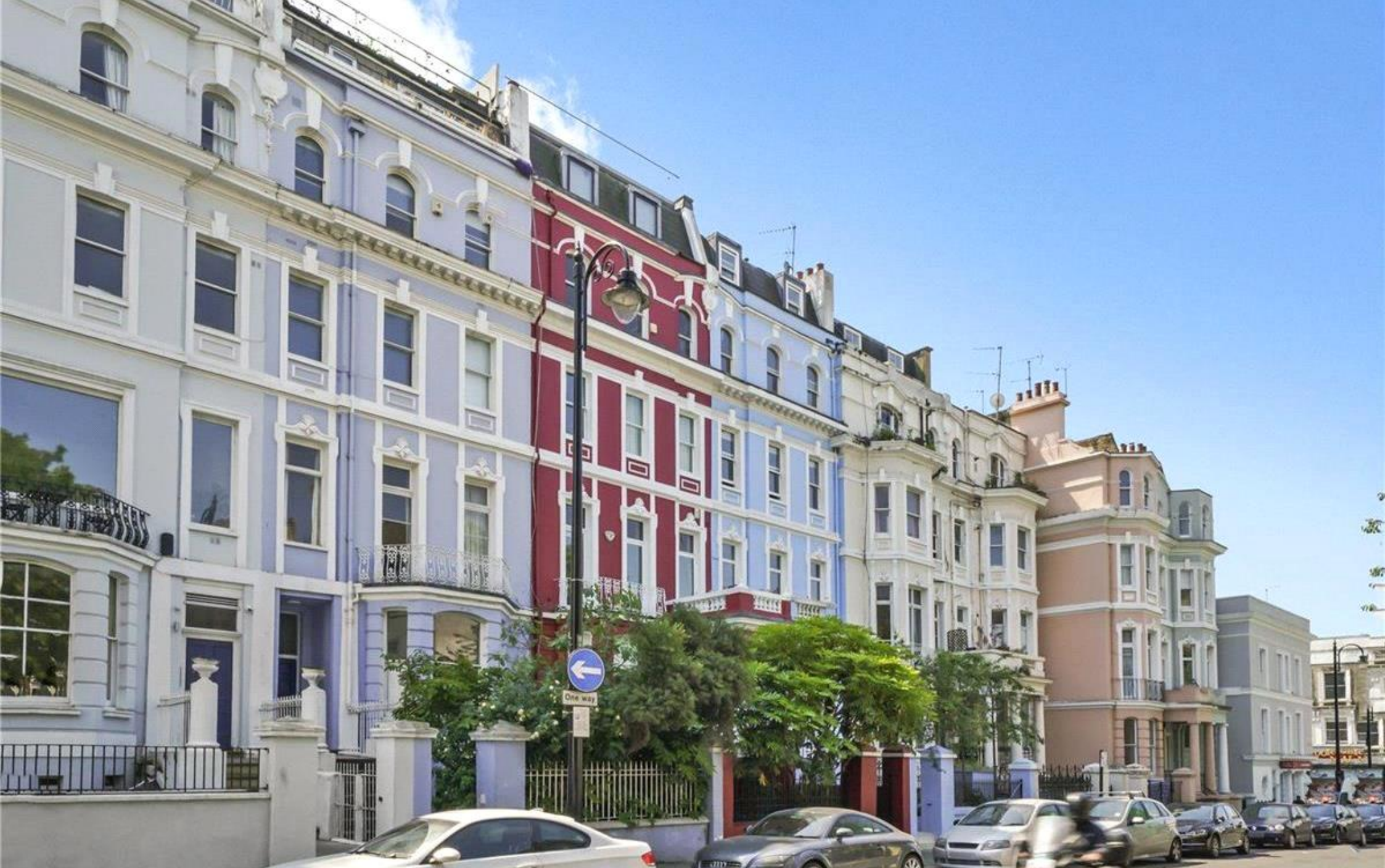
Colville Terrace, W11