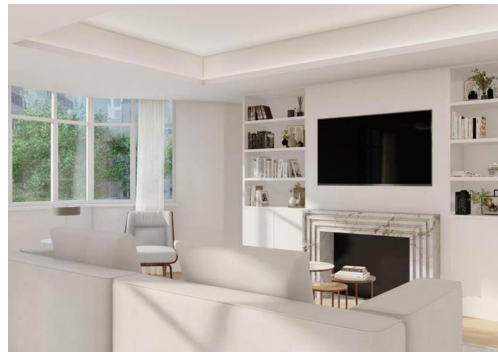
Melton Court, South Kensington, SW7 3JQ Approx. Gross Internal Area 1401 Sq Ft - 130.15 Sq M