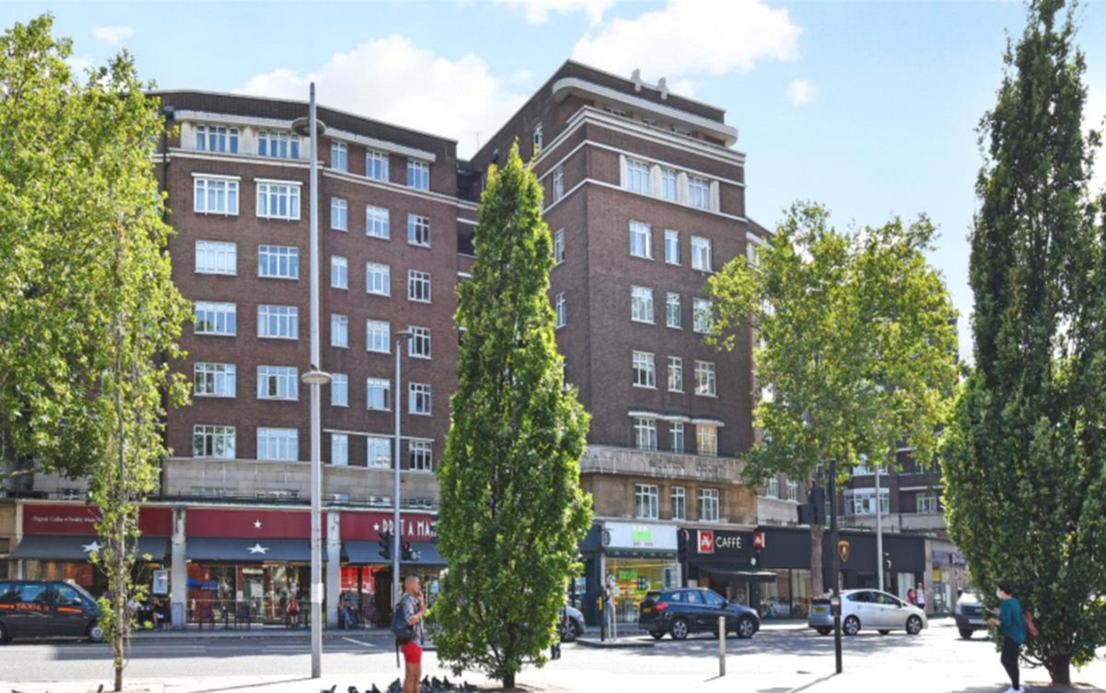
Melton Court, SW7