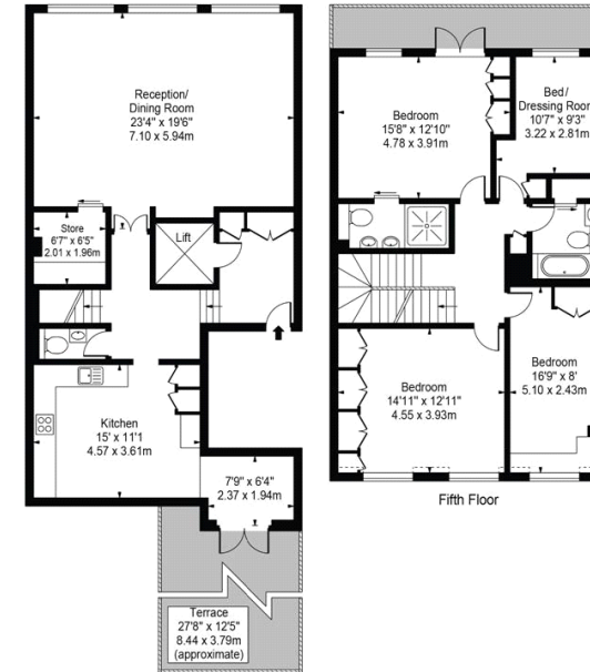
Fourth Floor For Illustration Purposes Only - Not To Scale

This floor plan should be used as a general outline for guidance only and does not constitute in whole or in part an offer or contract. Any intending purchaser or lessee should satisfy themselves by inspection, searches, enquiries and full survey as to the correctness of each statement. Any areas, measurements or distances quoted are approximate and should not be used to value a property or be the basis of any sale or let.