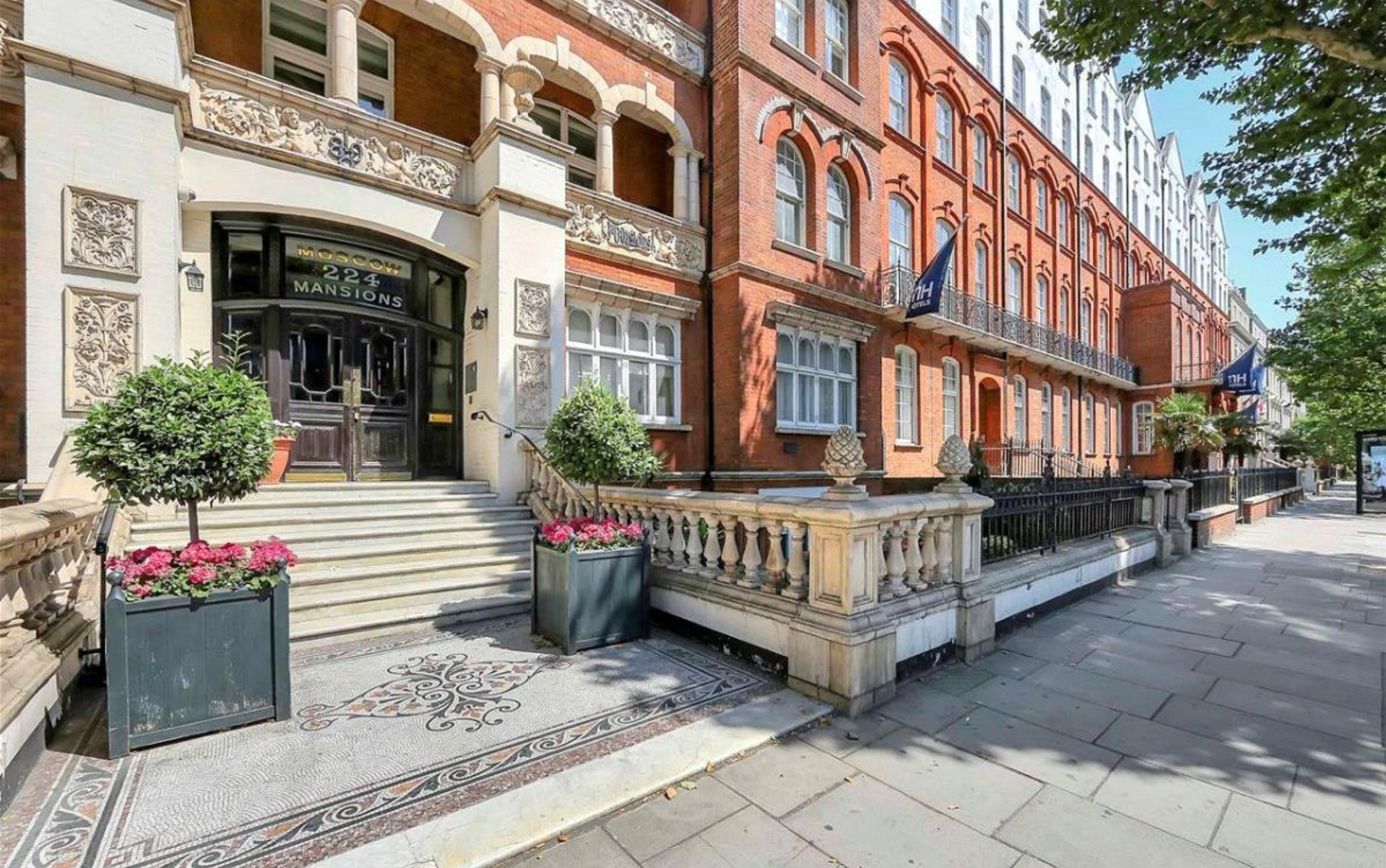
Moscow Mansions, SW5