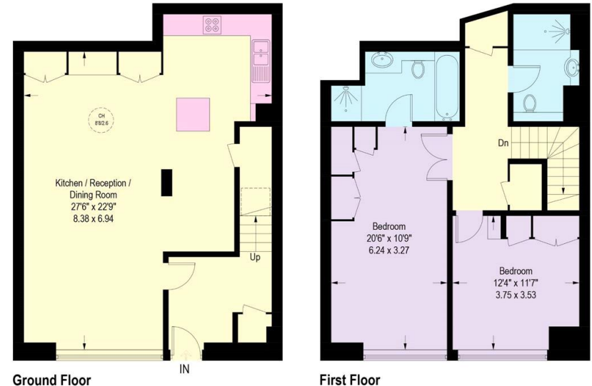
Illustration for identification purposes only, measurements are approximate, not to scale. (ID982689)