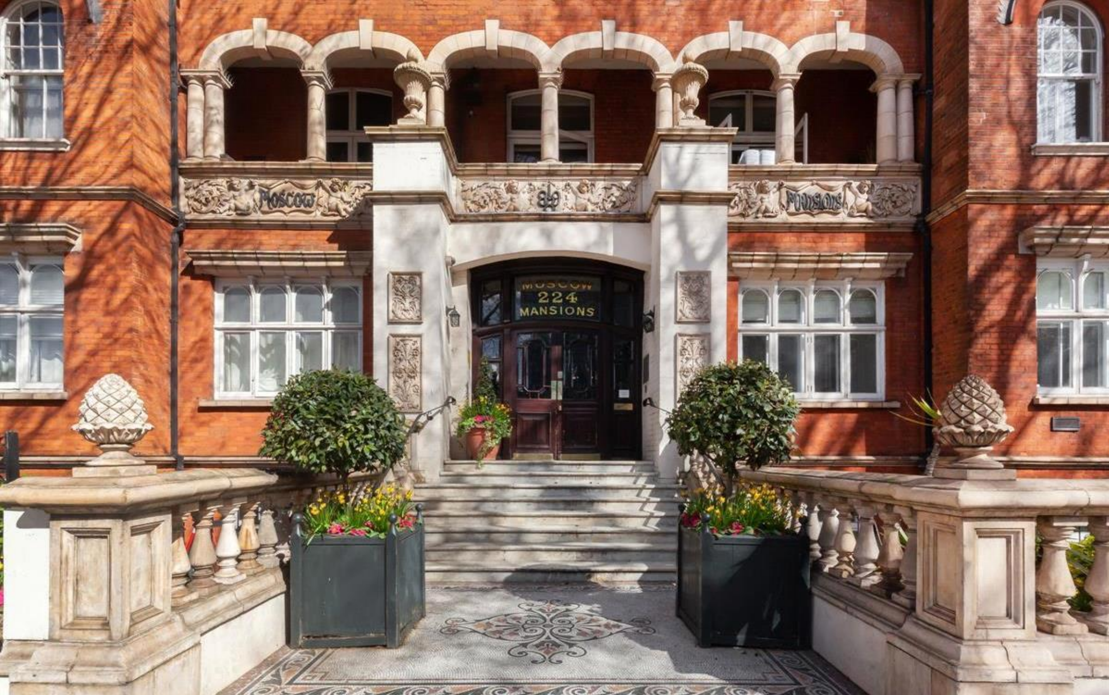
Moscow Mansions, SW5