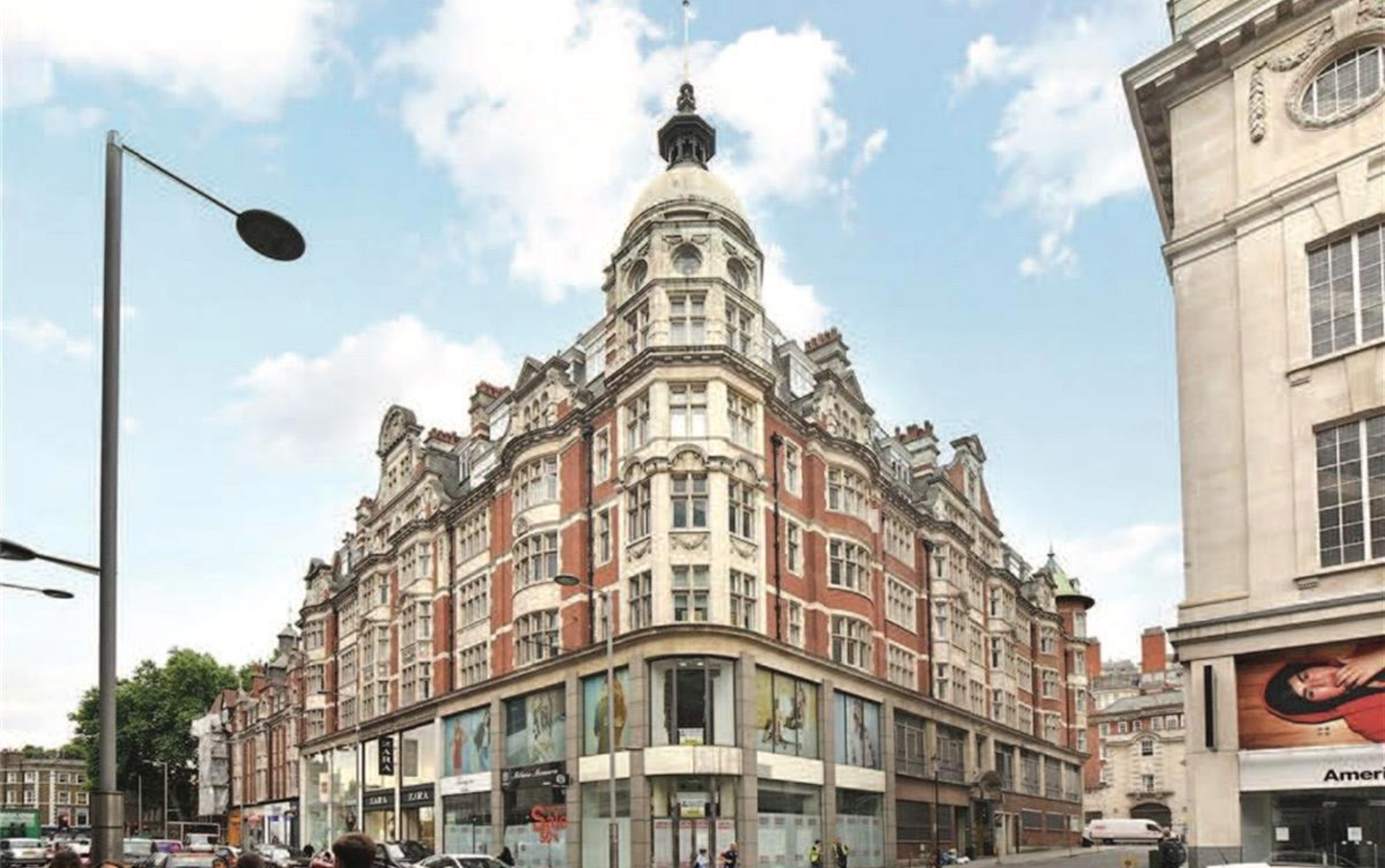
Old Court Place, W8