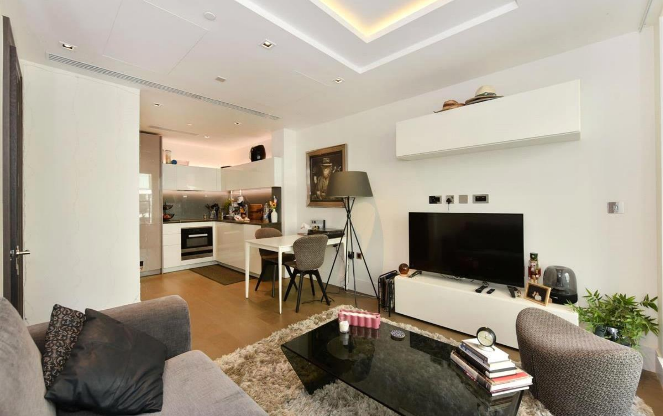
Radnor Terrace, W14