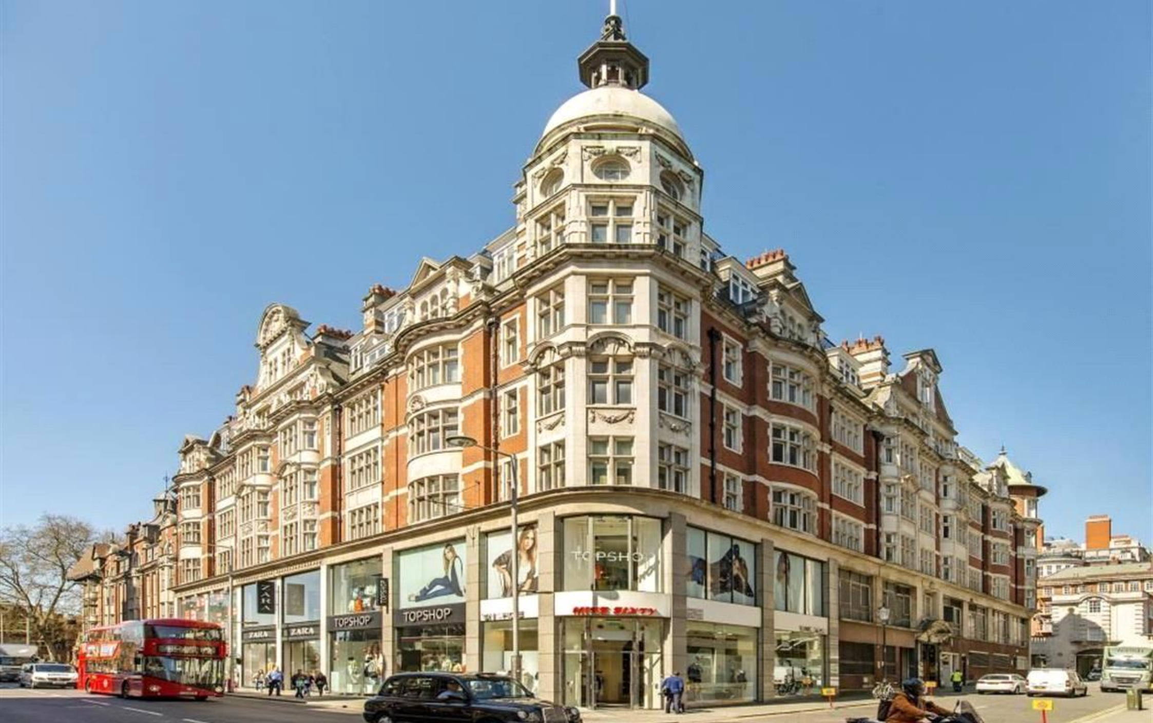
Old Court Place, W8