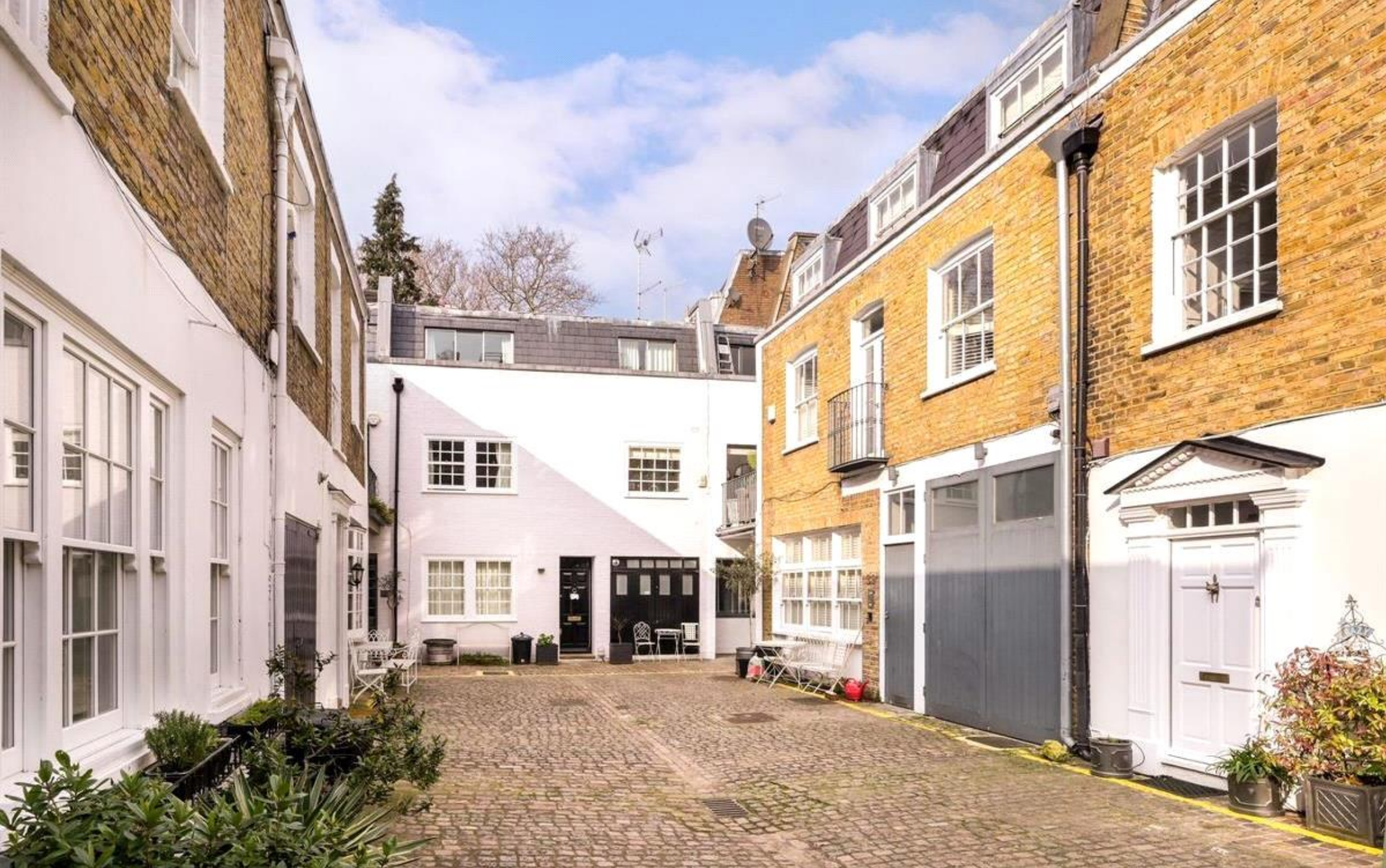
Queen's Gate Mews, SW7