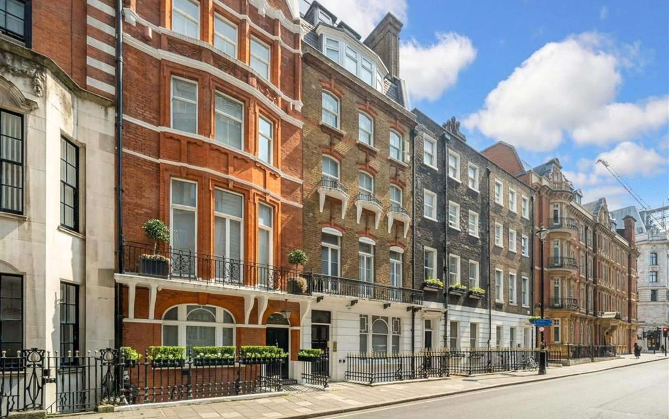
Welbeck Street, London