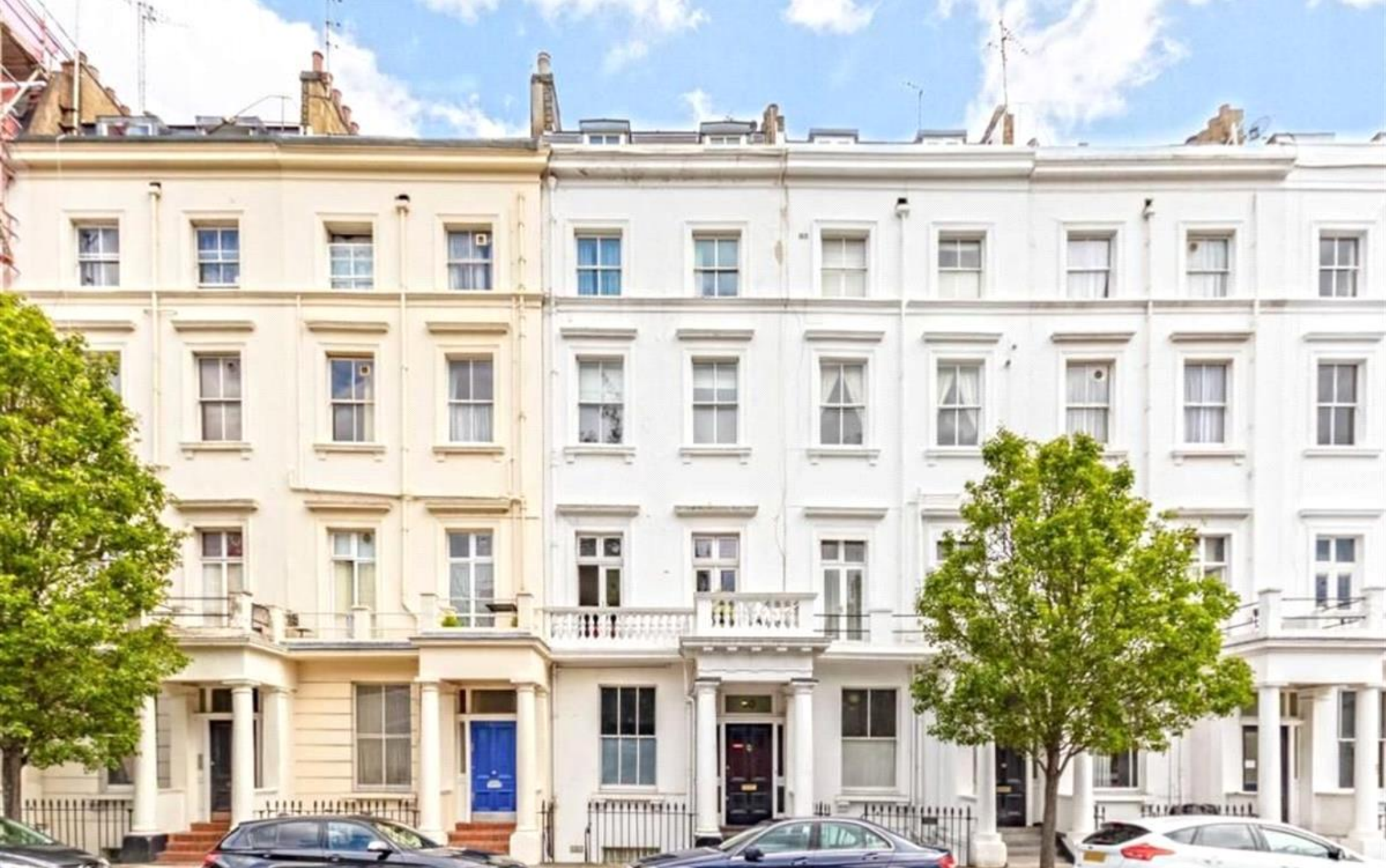
Claverton Street, London