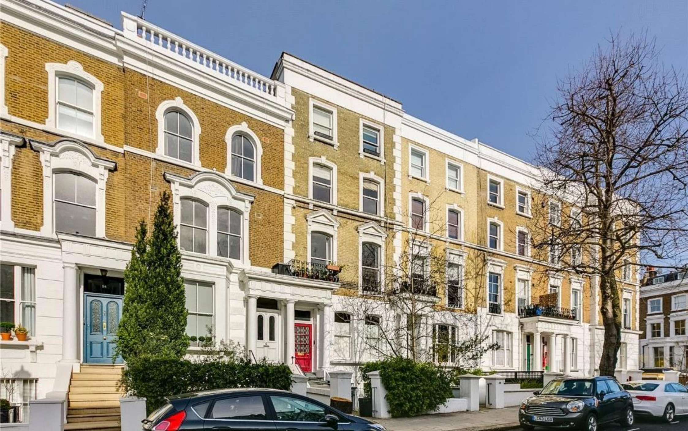
Blenheim Crescent, W11